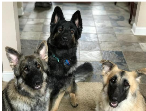
L to R: Poppins, Onyx, and Barlow